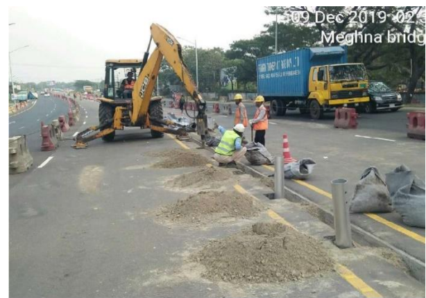
Figure 6. Use of modern road paving equipment and light drilling machine during road works.