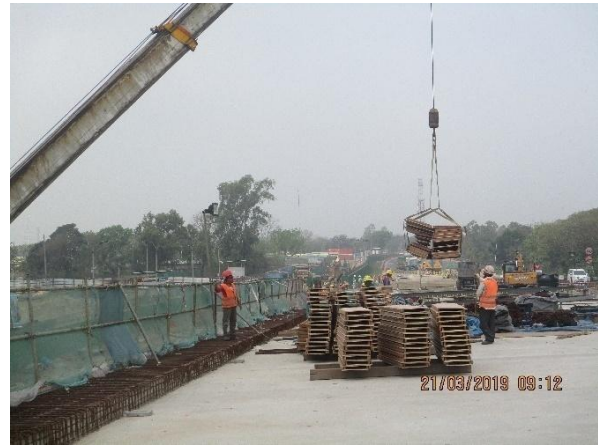
Figure 4. Lifting of heavy loads with forklifts and cranes.