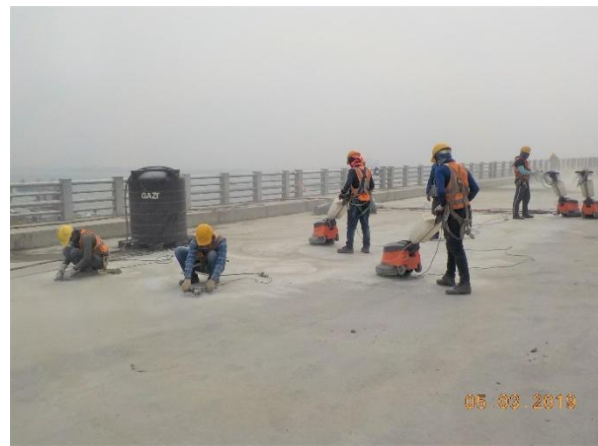
Figure 5. Use of PPEs by the workers during superstructure construction.