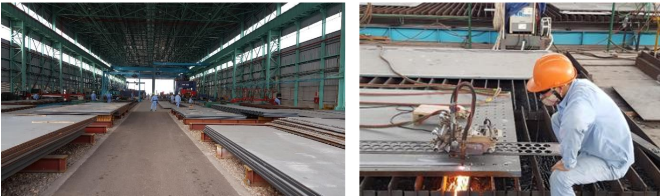
Figure 2. Use of precision laser cutting machine in prefabrication of narrow box steel girder in Vietnam.

The technology used in the KMGP is considered to be most advanced in Bridge Construction industry all of the world. The superstructure consists of composite deck slab on Pre-fabricated narrow box steel girder. Sub-structure was constructed with composite foundation on pre-fabricated Steel Pipe Sheet Piles. Prefabrication of Steel Pipe Sheet Pipes allows the Project Managers to outsource the fabrication process away from the Project site and avoid contamination due to close physical contact with the workers.