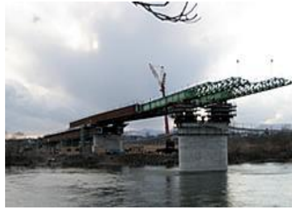
Figure 7. Use of nose girder for narrow box girder erection.